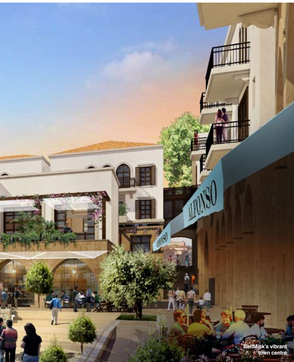
BeitMisk's vibrant town centre