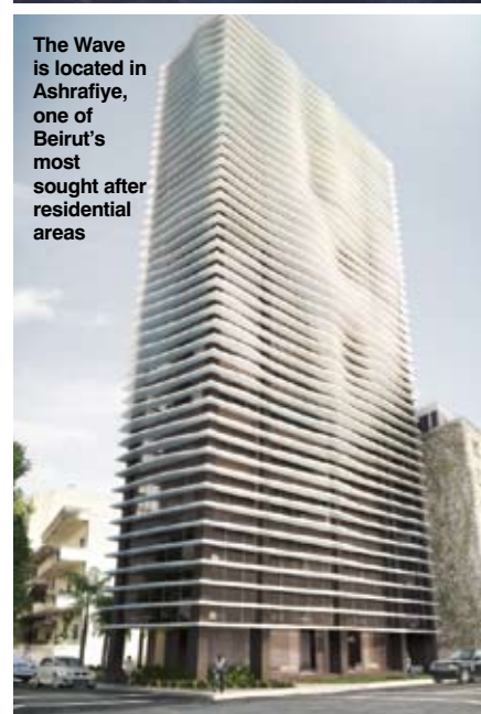
The Wave is located in Ashrafiye, one of Beirut's most sought after residential areas

range in sizes and cater to all individuals but what they all have in common is their key locations and their artistic yet functional approach to the design.